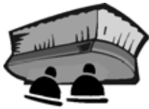
Figure 14.1: Suction Cup Fingernail Brush

Some clients may be able to clean their own fingernails with assistance (see Figure 14.1). Provide assistive devices per service plan.